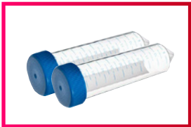
Centrifuge Tube 50ml - Tray of 25 BIO-BSM227270 (TRAY)