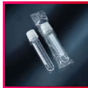
Test Tube 14ml, 17 x 100mm, PS, Graduated - Bag of 25 BIO-BSF2051