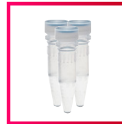
Microtube 2ml, O-ring Cap, 47.2mm, Conical - Bag of 100 BIO-CL744/S (BAG)