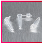
PCR Microtube 0.5ml with Flat Cap - Bag of 250 BIO-016155 (BAG)